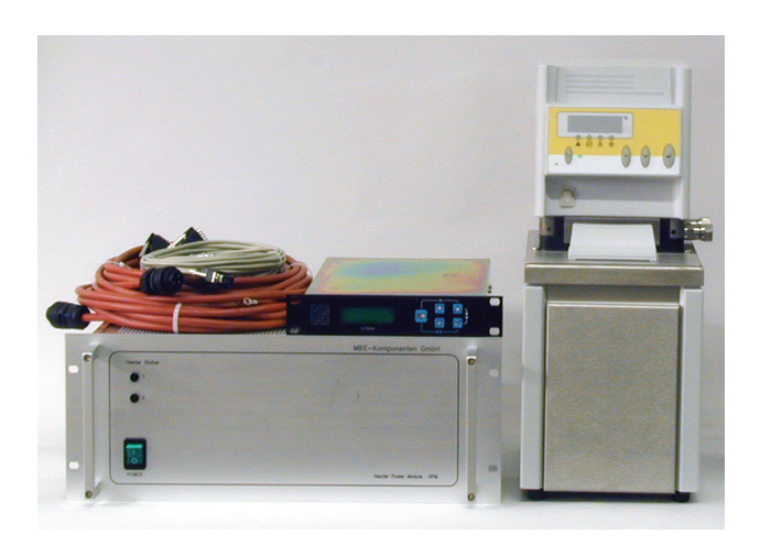
\ensuremath{\mathsf{HPM}} power supply, controllers, cables and heating thermostat for the AKS system