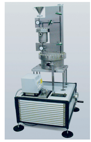
HGSU Control Unit for use with HGS source: electronic rack and table with liquid bath temperature controller and external reservoirs