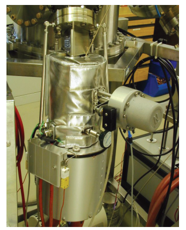
HGS 63-250 source for mercury evaporation with 250 \rm cm^3 evaporator mounted to UHV Chamber