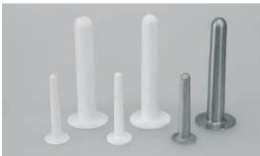
Different ceramic and metal crucibles (1.5 and 10 cm 3 ) for HTEZ

Well-designed tungsten filaments are demonstrably to be very stable, thus safeguarding a long lifetime even when working on the upper limit of the cells.