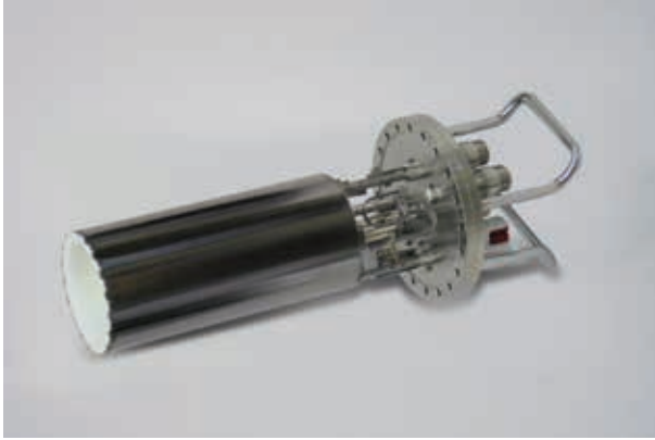
PEZ 150-700-125 large capacity Ga/In production effusion cell on DN150CF (O.D. 8") mounting flange

The Production Effusion Cell with beam shaping crucible insert is the ideal well proven source for evaporation or sublimation of gallium, indium, and other materials in MBE growth applications.