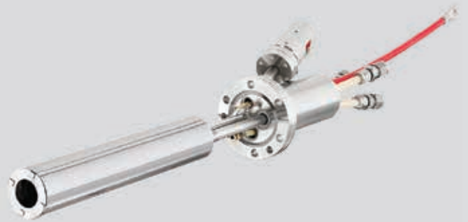
SUKO-A 40 on DN40CF (O.D. 2.75") flange