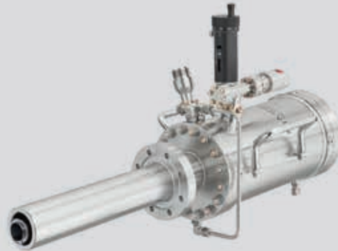
VACS 100-300 mounted to VADP 100-63 adapter with DN63CF (O.D. 4.5") mounting flange