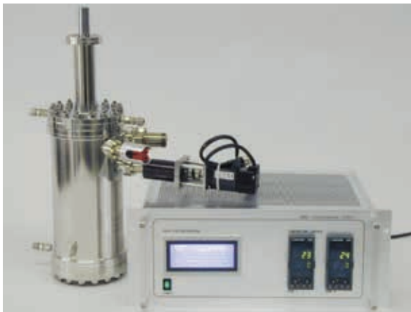
VACS 40-500-K-M with motor drive and motorized valve control unit MVCU