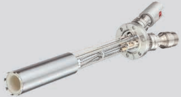
WEZ 40-35-37 on DN40CF (O.D. 2.75") flange